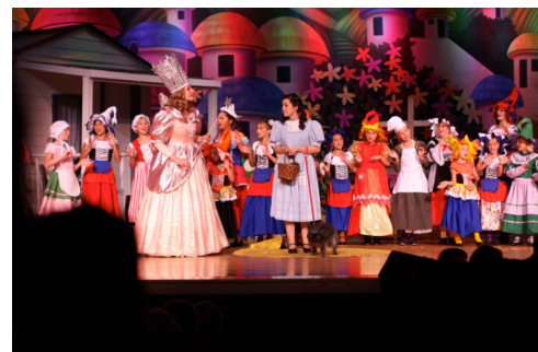
"The Wizard of Oz - 2010"