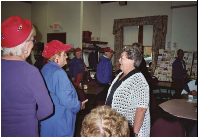
Bonnie's Retirement Party