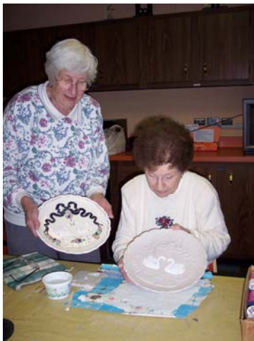
Pottery Class with future wedding gifts for family. Fun & Functional!