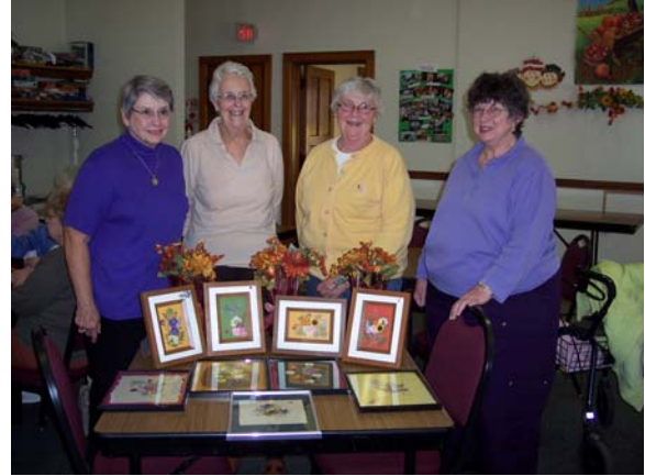
Pressed Flower Craft Project – Come and purchase one at the Nov. 17 Craft Sale