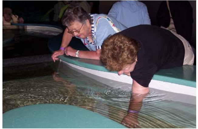
Touching a sting ray at Pier Wisconsin – Day Trip Fun!

In a mixing bowl, beat sugar, butter, honey, and lavender until fluffy. Add sour cream, eggs, and vanilla. Mix well. In another bowl, stir together the flour, baking powder, baking soda and salt. Add to creamed mixture. Mix until well blended. Spread in a greased 9x13 inch pan. Sprinkle the almonds and blueberries over the dough. Mix the streusel ingredients together until crumbly and place over the top of the coffee cake. Bake at 350 F for about 50 minutes or until a tester inserted in the center comes out clean. Cool before serving.