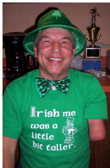
Celebrating being Irish!