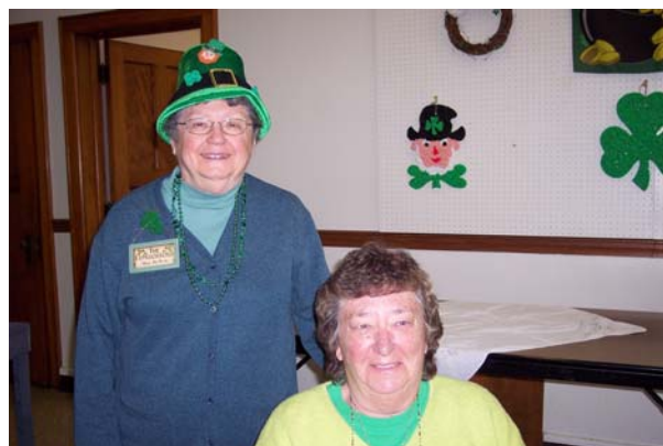
Irish for the day!