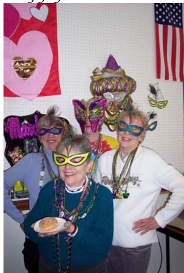
Mardi Gras at the Center Feb 17

Friends of the Port Washington Senior Center – A 501C-3 Non-Profit group that supports seniors through the senior center programs. Started in April 2009! May sponsor events for community adult participation with membership open to ages 21 and older. See Experience Dance page 6. Friends of the Senior Center Happy 1 st Anniversary April 27