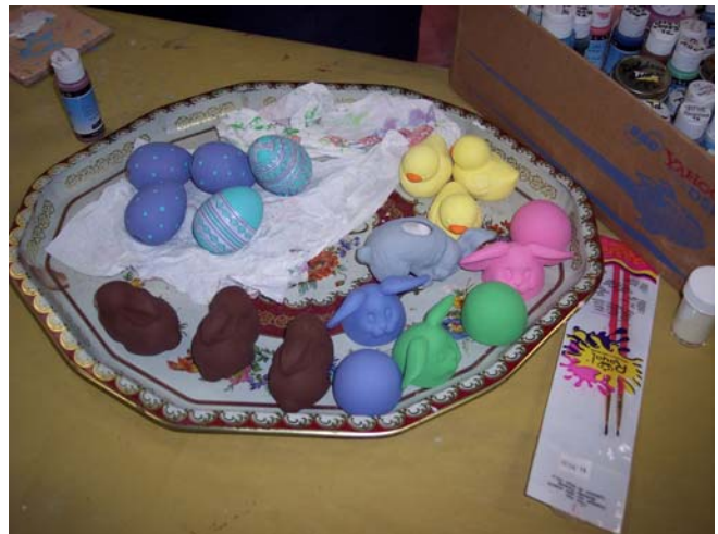
Soon to be ready ceramic pieces for Sale in the showcase!